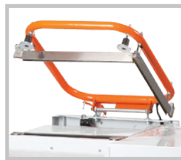
Temp controlled seal system