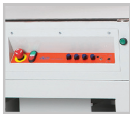
User friendly controls